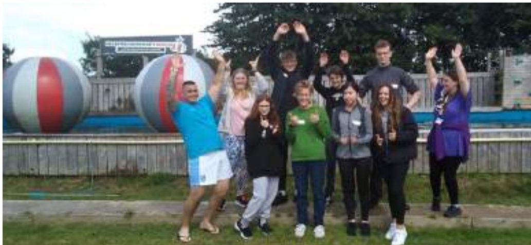
Celebrating their successes! The NCS team letting off steam at the Ultimate Wipeout Centre - you lot deserve it after all that car washing!

Thanks so much to you all - your efforts are so appreciated by all of us here at Little Valley, and by the animals we care for.